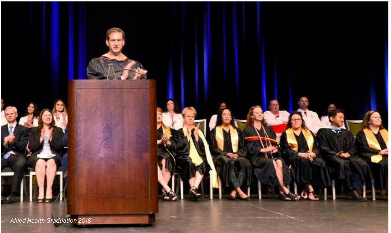
Allied Health Graduation 2018