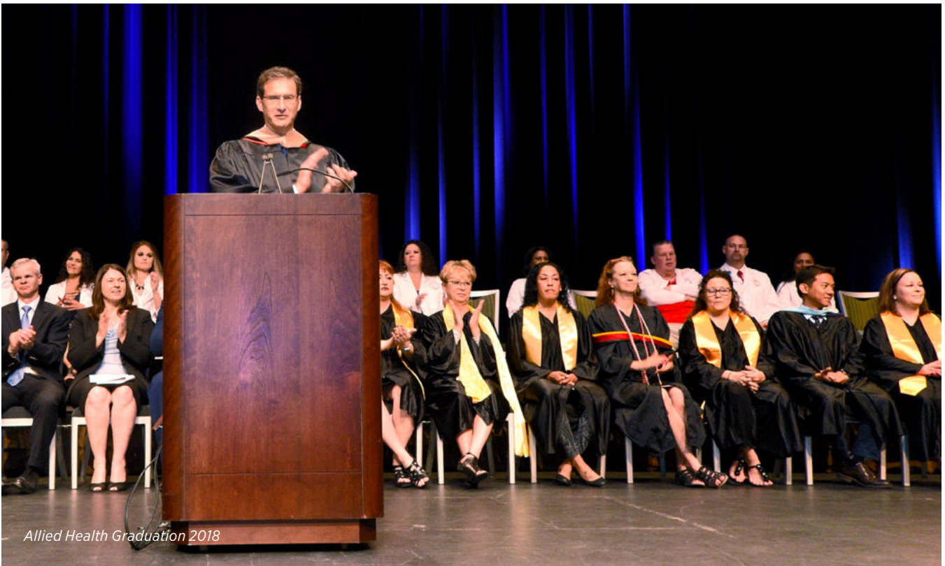
Allied Health Graduation 2018