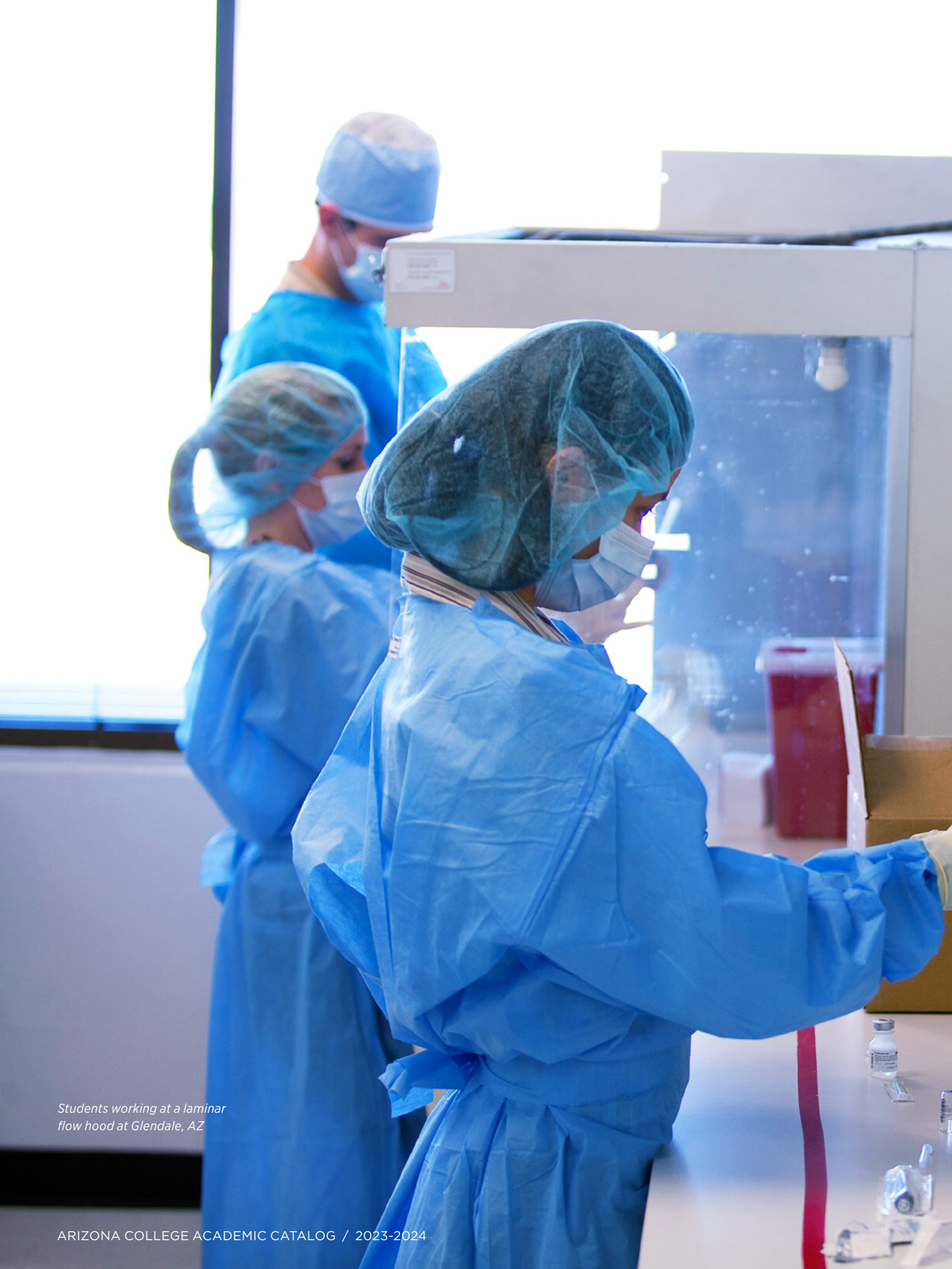
Students working at a laminar flow hood at Glendale, AZ