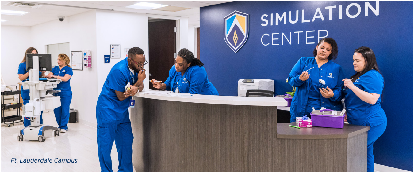
Ft. Lauderdale Campus