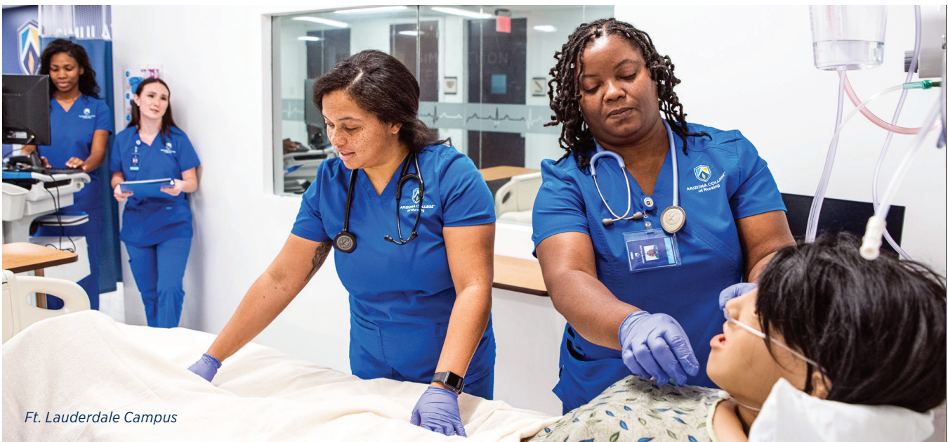
Ft. Lauderdale Campus