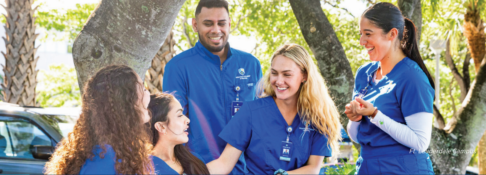
Ft. Lauderdale Campus