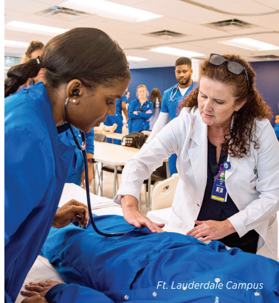
Ft. Lauderdale Campus