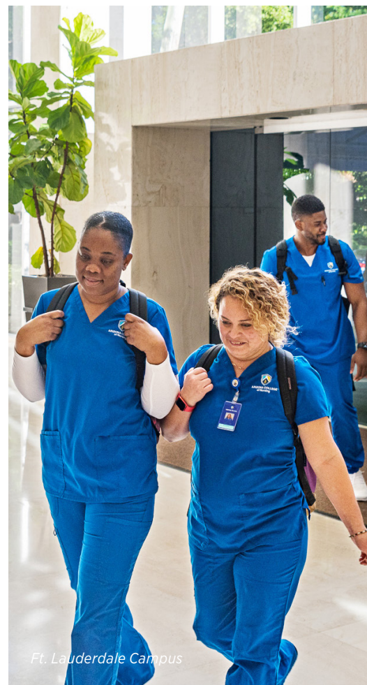
Ft. Lauderdale Campus

The "For Cause" substance screening applies to all Arizona College of Nursing students. Students are subject to screening if a staff member, faculty, and/or an agency staff member suspects the student is impaired at any time on campus or during any clinical experience or college-sponsored activity. This includes but is not